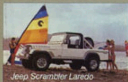
Jeep Scrambler Laredo