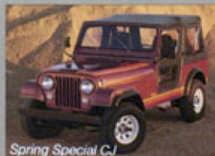
Spring Special CJ