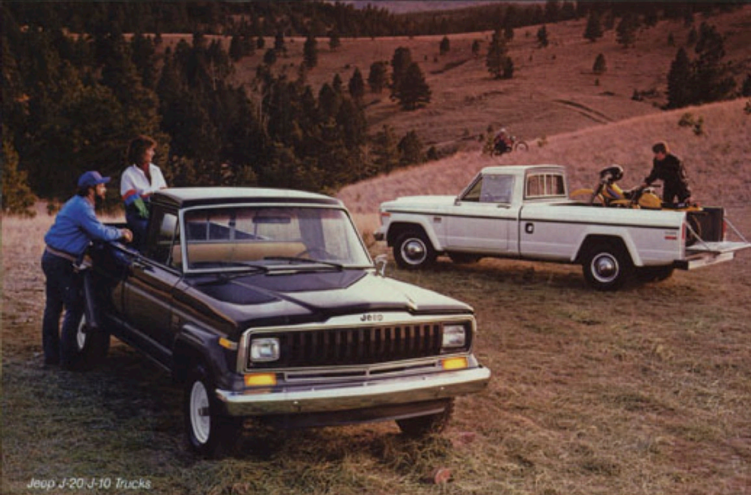
Jeep J-20 J-10 Trucks

Compare Jeep Trucks to the "competition." You'll see that only Jeep Trucks offer optional Selec-Trac, the all-surface "shift-on-the-fly" system that lets you shift from 2-wheel drive to 4-wheel drive at the flick of a switch, from the driver's seat...without stopping.