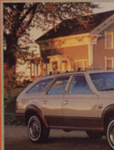
American Eagle Wagon

American Eagle defies comparison! It is a well-appointed and equipped vehicle that's ready to take you and your family almost anywhere—in style and comfort—