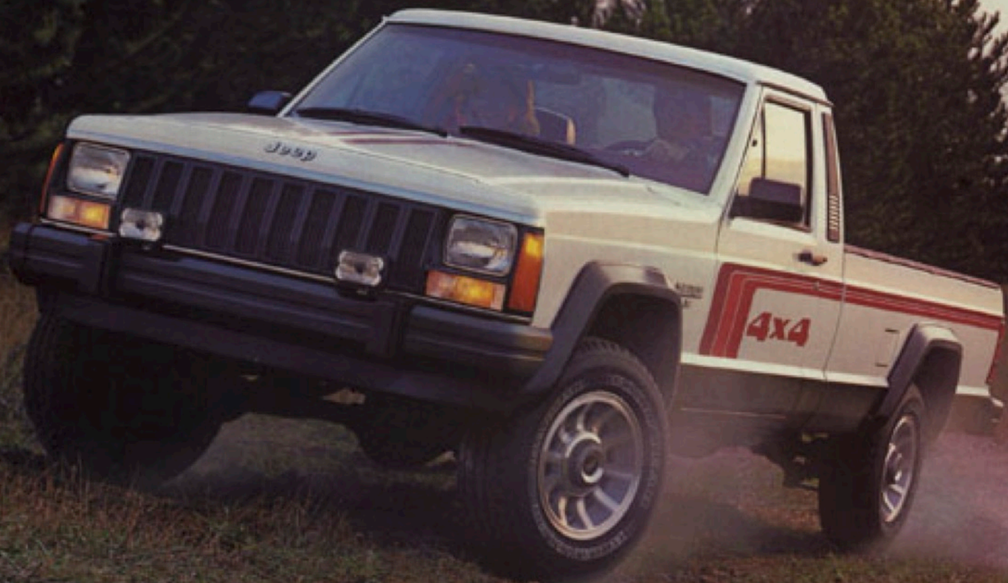
New Jeep Comanche