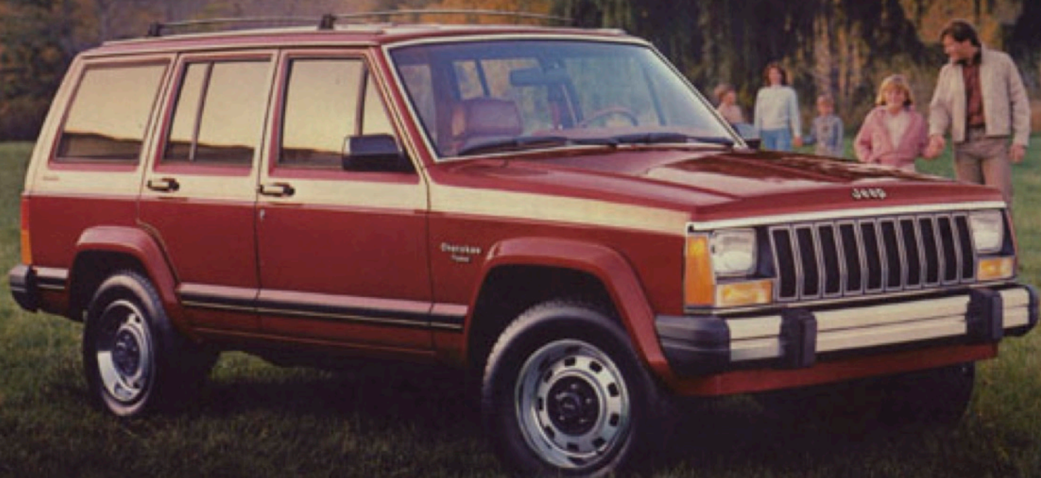
Cherokee Pioneer 4-door