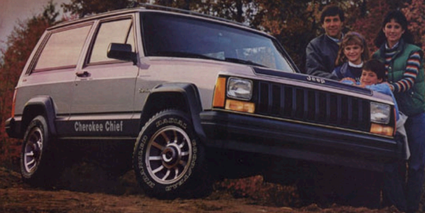
Cherokee Chief 2-door