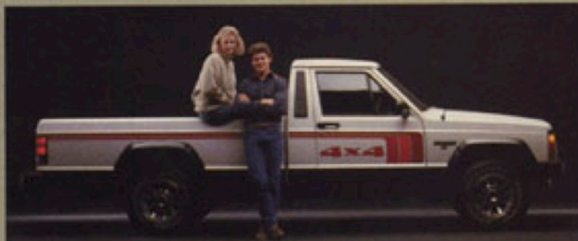
Experience the fun of 4-wheel drive in the rugged new Comanche.

There is much to see at your Renault/Jeep dealer. So come in and take a test drive and experience the feeling you can get... only in a Jeep!