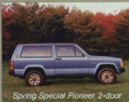
Spring Special Pioneer 2-door

If you had to pick a "do-it-all" pickup, it would be Jeep. These trucks are heavy-duty! Their 7.8 foot long cargo boxes have payload capacities of more than 2 tons. And with an optional towing package, these trucks can tow trailers of up to 8,000 pounds. High ground clearance yet low loading height make loading these pickups a cinch. And J-20 has a heavy-duty cooling system, front stabilizer bar, fuel tank skid plate and tinted glass, standard. Ford F-250 and Dodge W-250 don't. Best of all, these trucks are built with the same 4-wheel drive technology Jeep is famous for. This translates into 4-wheel drive Jeep toughness.