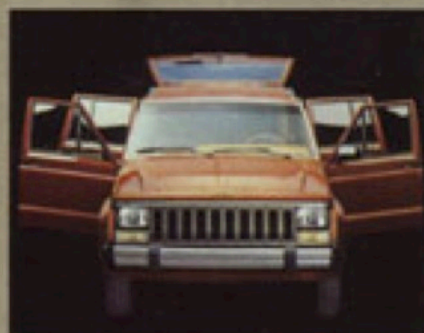
Only Cherokee has the ease of four doors.